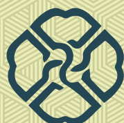
University of Kurdistan