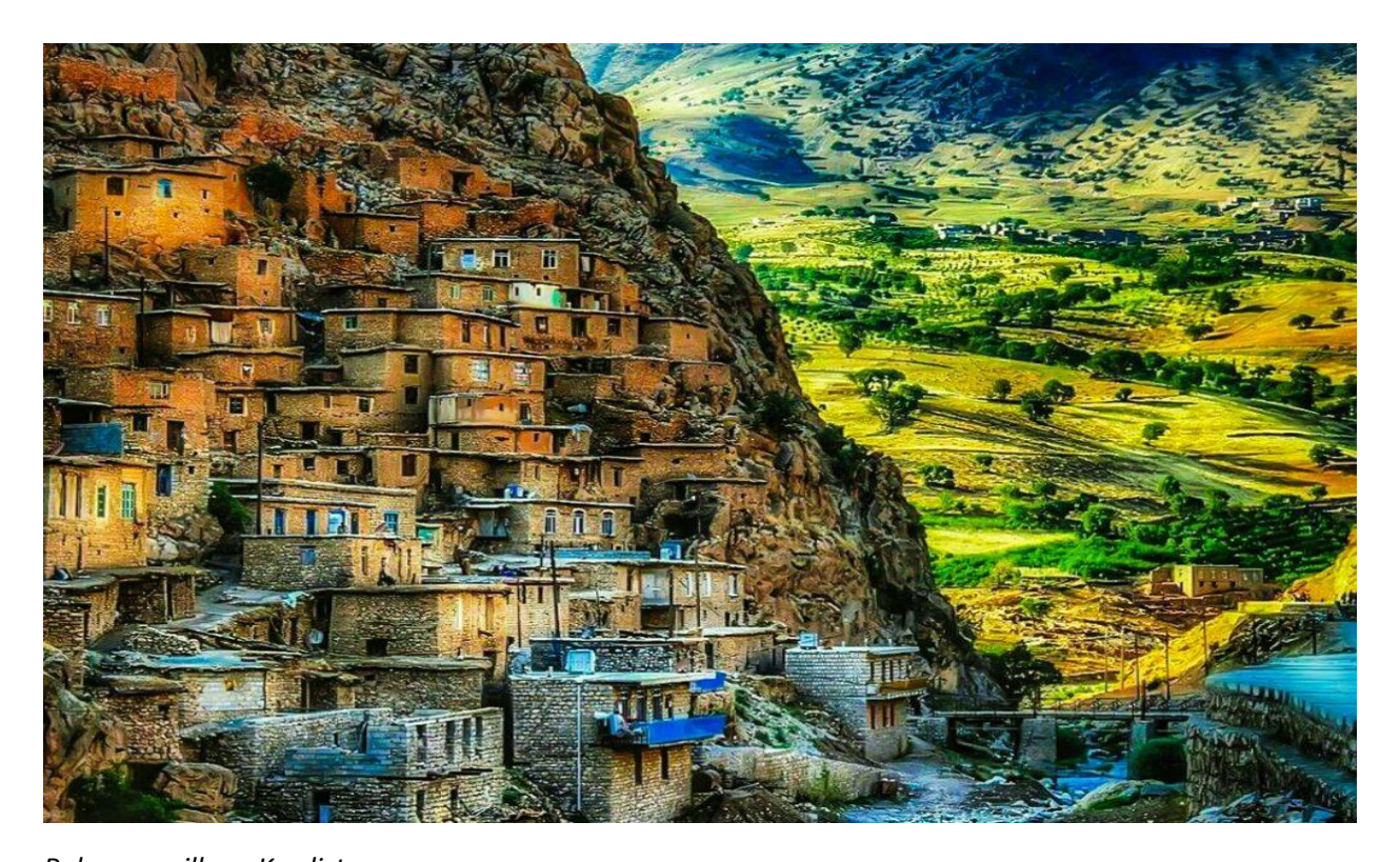
Palangan village Kurdistan.