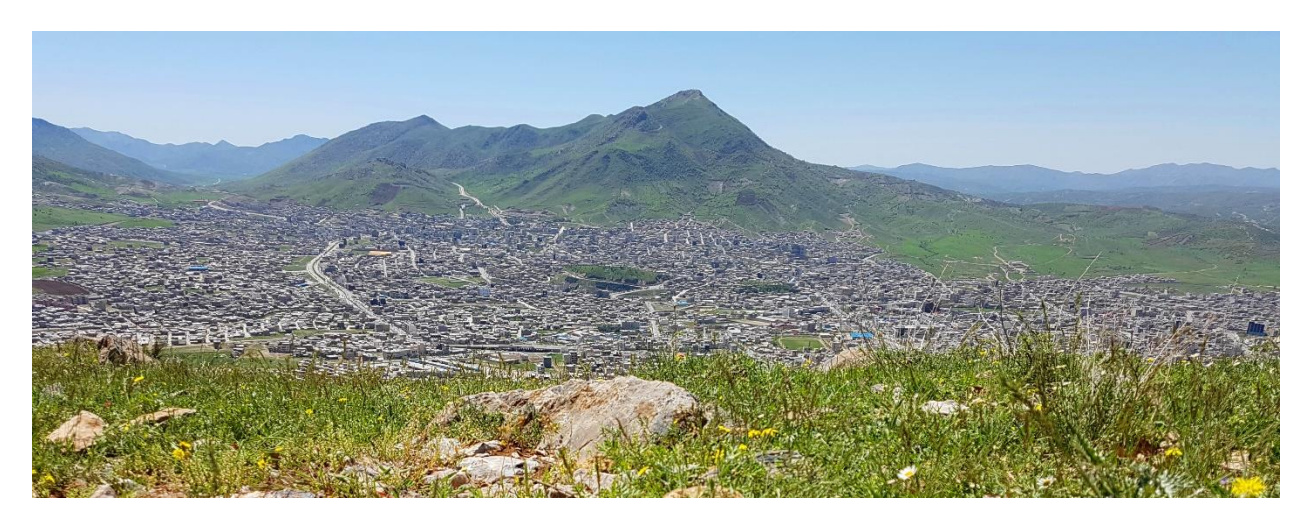
Arbaba Mountain, Bana, Kurdistan